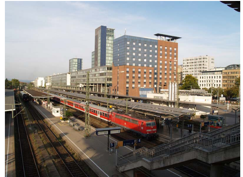
The main station – a traffic nodal point